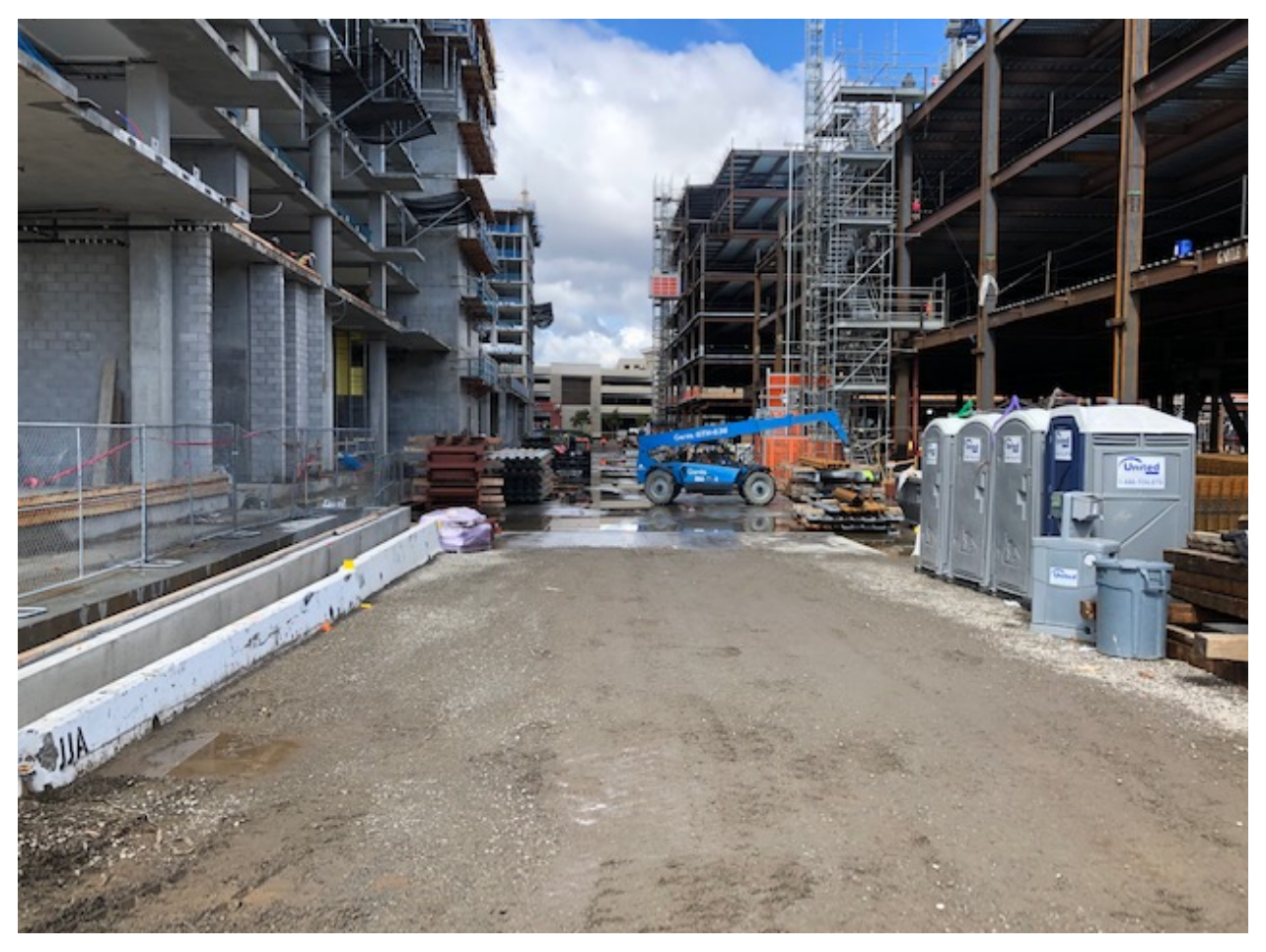
Future Vargas Street between the commercial office buildings and the residential buildings connecting S. Taaffe Avenue and S. Murphy Avenue.